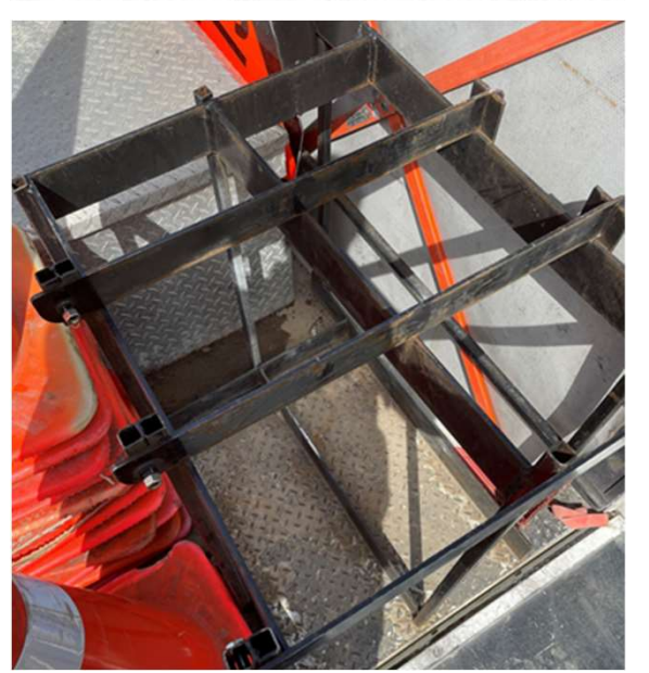
Drawing(s) and bill of materials will be added when available.